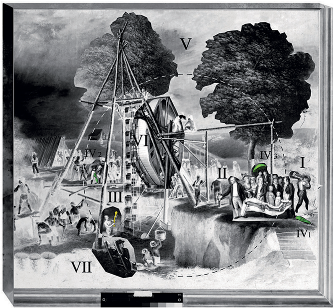
A version of Kew. Rhone. 's artwork for its CD-ROM release in 1998 as Kew. Rom.