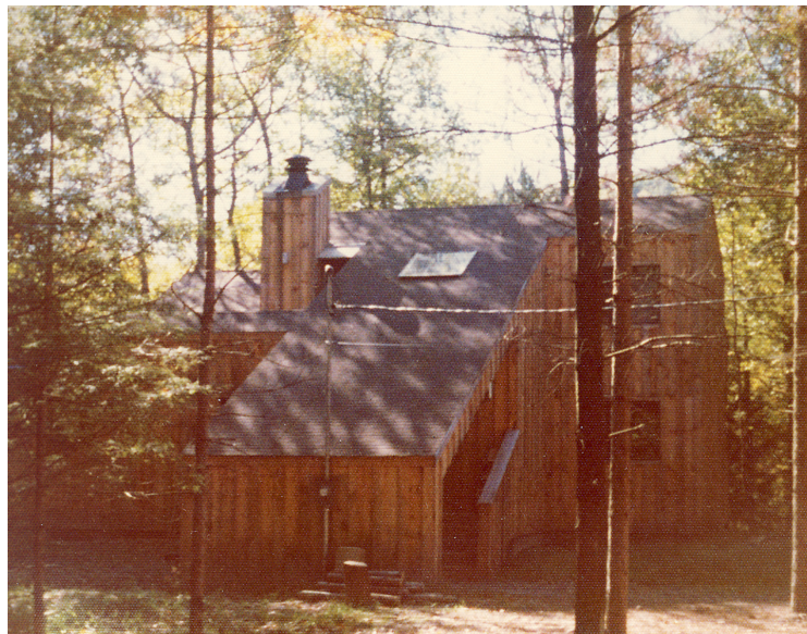
Carla Bley and Mike Mantler's Woodstock studio, Grog Kill, 1976